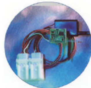
The Solid State Temperature Switch combines a highly accurate temperature sensor and a switch in a low cost, compact rugged unit.