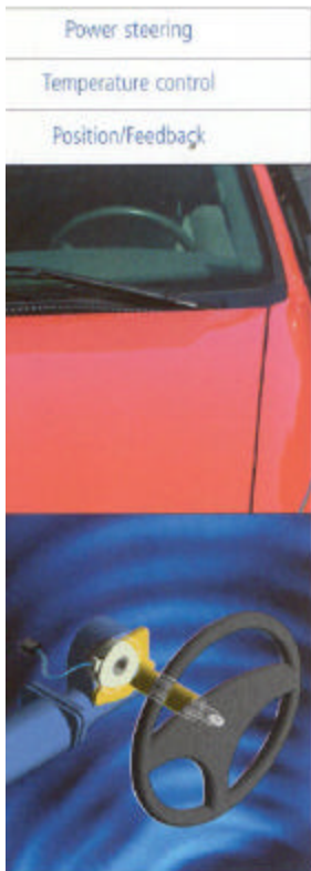
The EPS uses dual sensors to reduce the draw of electric power in power steering systems.

BI Technologies' capabilities extend to a variety of other automotive design functions, including seat position memory, pedal position, TPS, height leveling, smart cruise control, lumbar support, brake and EGR.